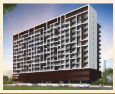
SWARNAVATIKA NIBM Road