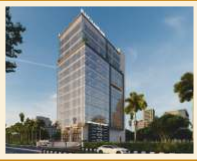
RAICHANDANI GATEWAY Kharadi