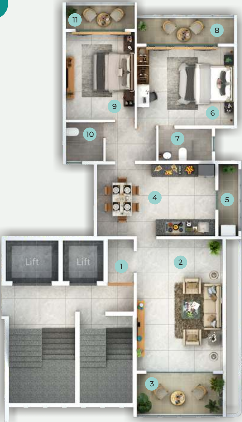
All Images are Artistic Impressions