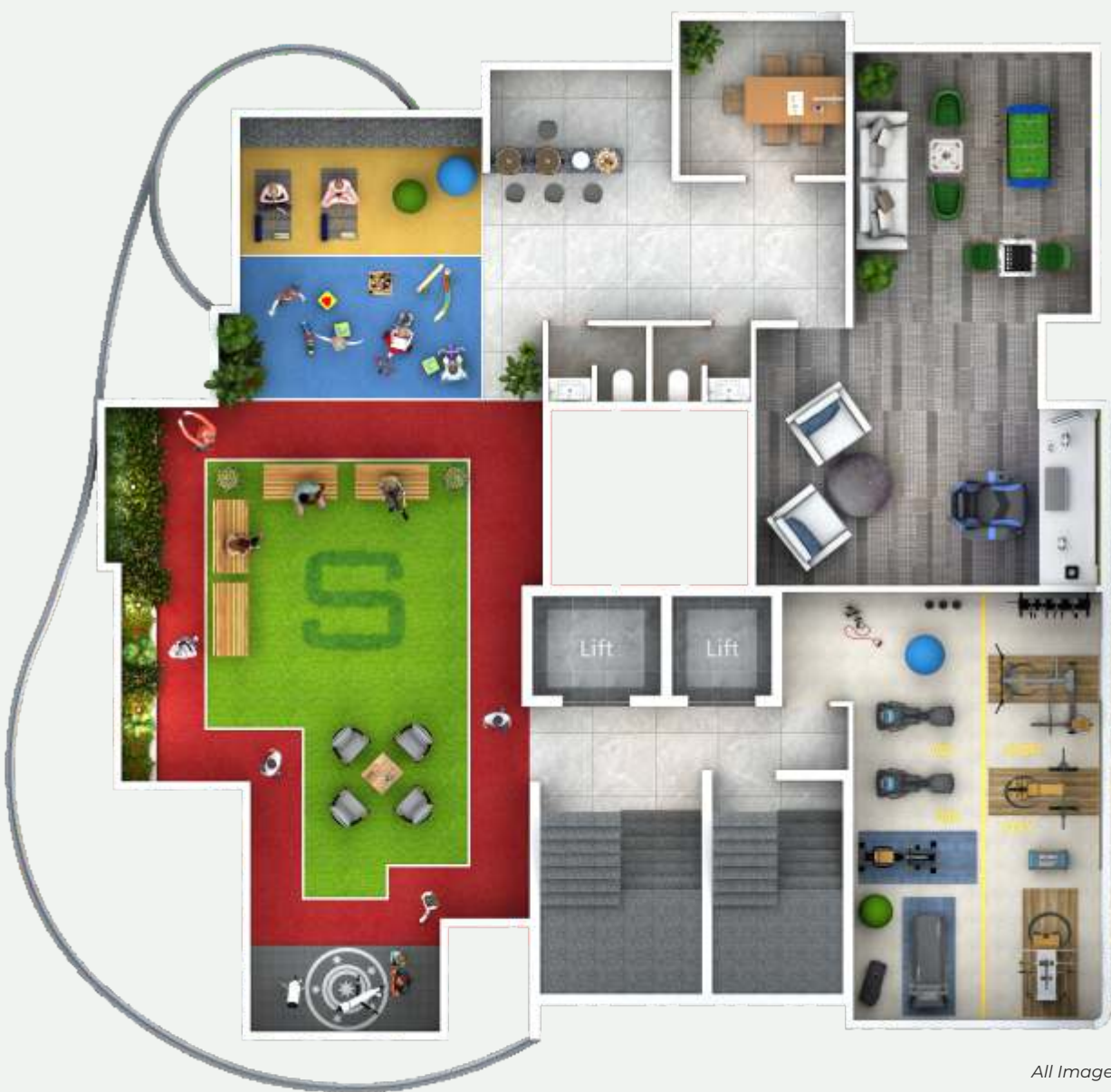
All Images are Artistic Impressions