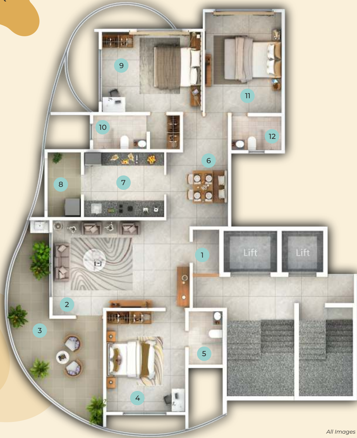
All Images are Artistic Impressions