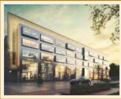
RAICHANDANI MALL Hyderabad