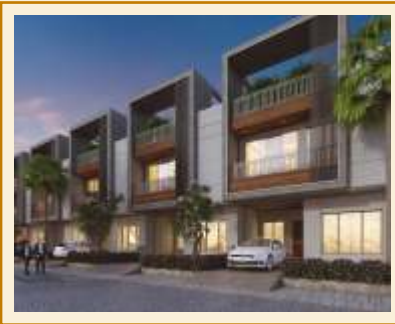
KRISHNA ENCLAVE Bhopal