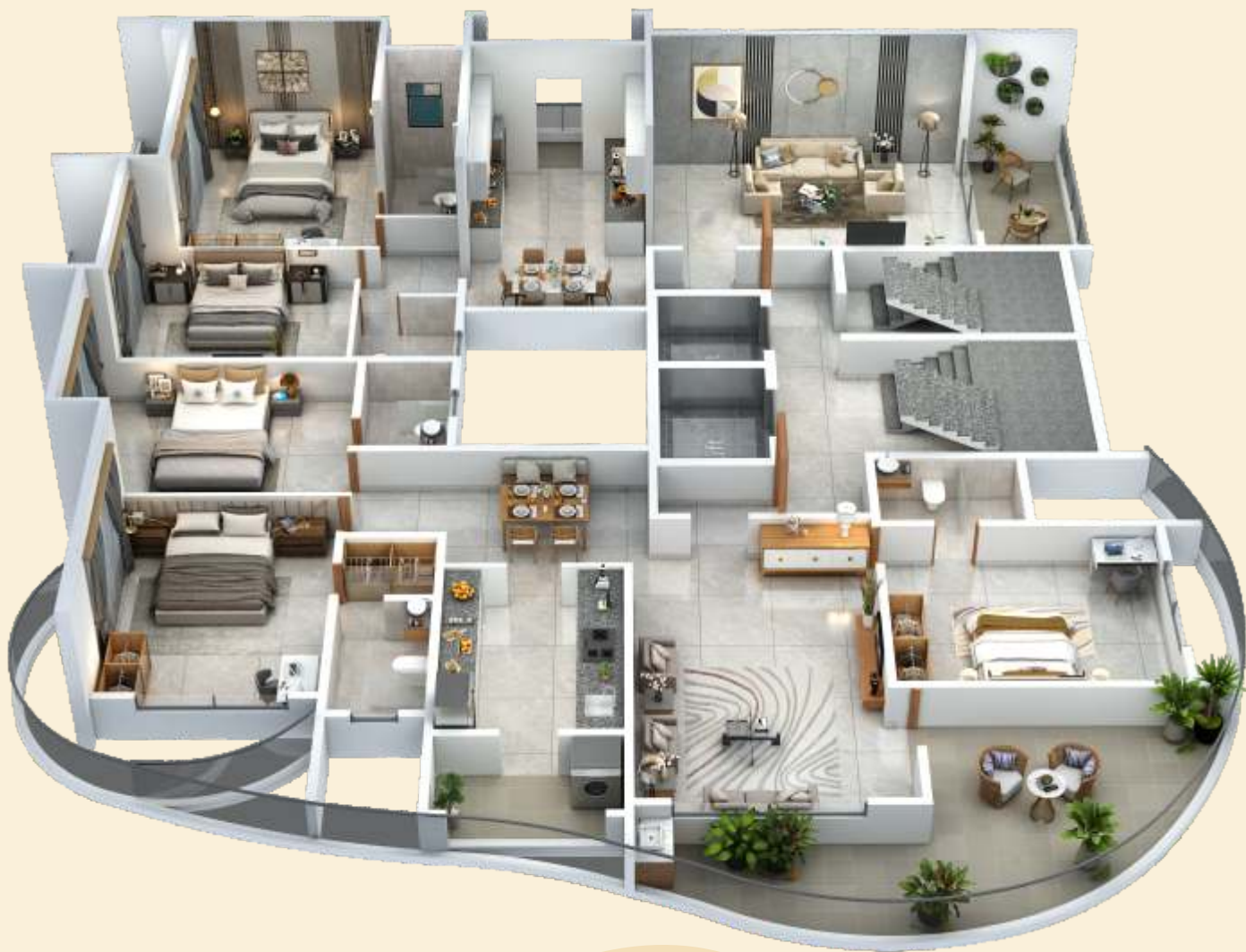
All Images are Artistic Impressions