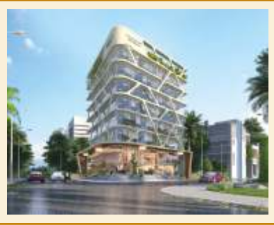
ALPHA C Pan Card Club Road