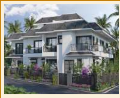
LA MARVEL Goa