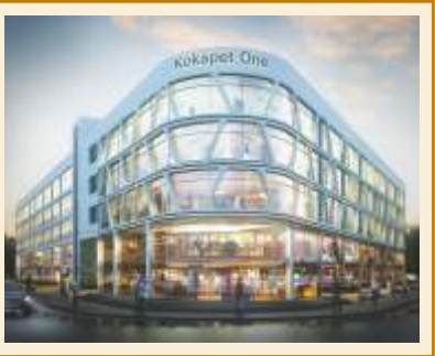
KOKAPET ONE Hyderabad