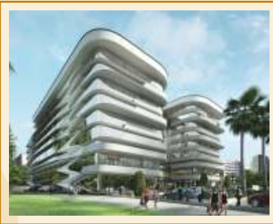
UNITY ONE Indore