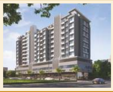
PENTAGON TOWERS Karvenagar