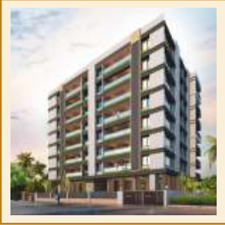
THE SHWET Baner